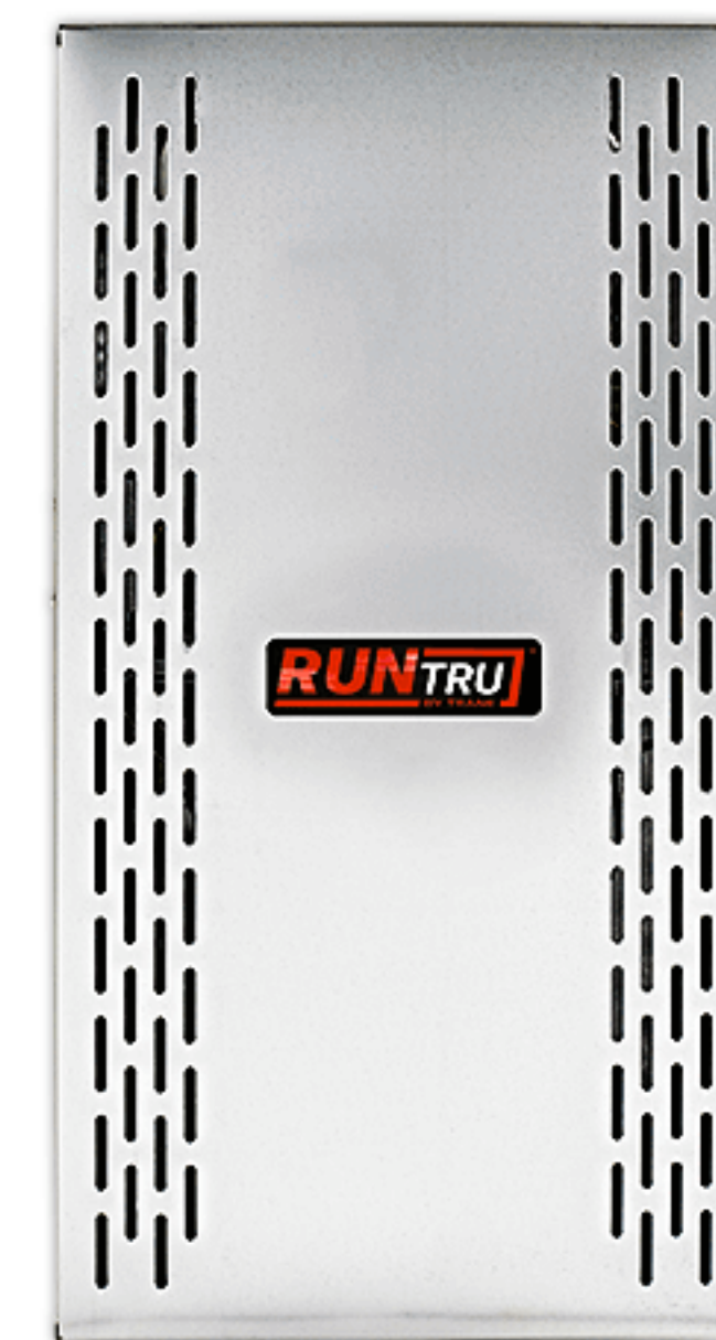
80% Gas Furnace A801X