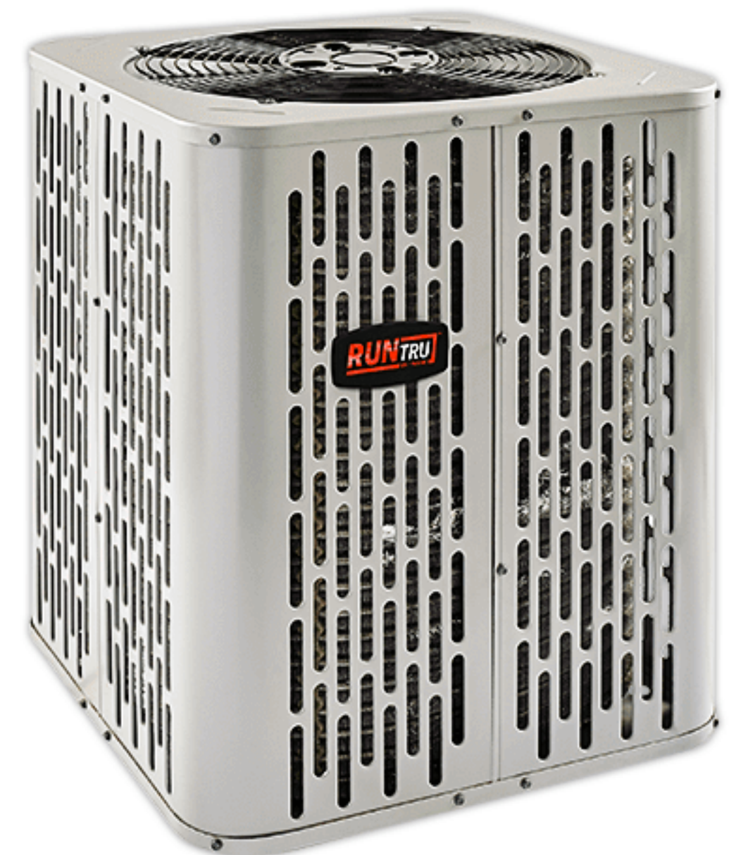
14 SEER Condenser A4AC4

20 year | Gas heat exchanger** • 10 year | Compressor & coil (indoor/outdoor)** • 5 year | Limited functional parts** **per limited warranty terms