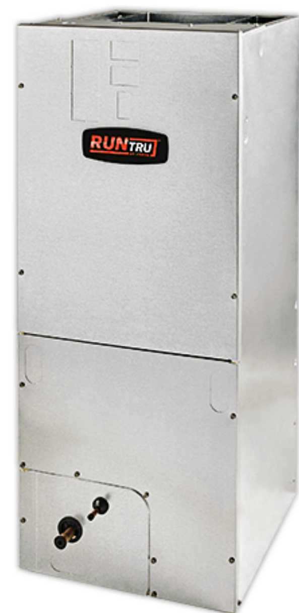
Air Handler A4AH4